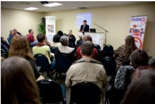
Welcome and Introductions for FODAC.